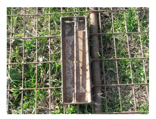
Movement of the trough triggers the gate to close via a tripwire connecting the two together.