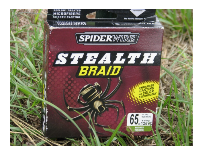
Saltwater braid fishing line doesn't stretch and its small diameter makes it more difficult for pigs to detect as compared to heavier tripwires.

5) Rooter Stick Trigger-The rooter stick is a novel approach that relies on the pig's rooting behavior to cause the gate to close. Since sub-adults don't root nearly as much as the adults, this technique can serve to delay gate closure until adult pigs enter the trap and all of the other bait placed inside the trap has been consumed.