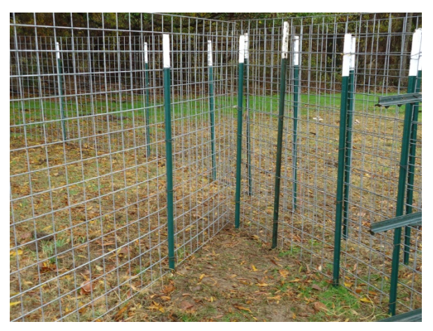
The "Wexford" (left) and "Figure 6 or 9" trap (right) designs feature no gate or trigger and have accounted for many pigs removed from the landscape.