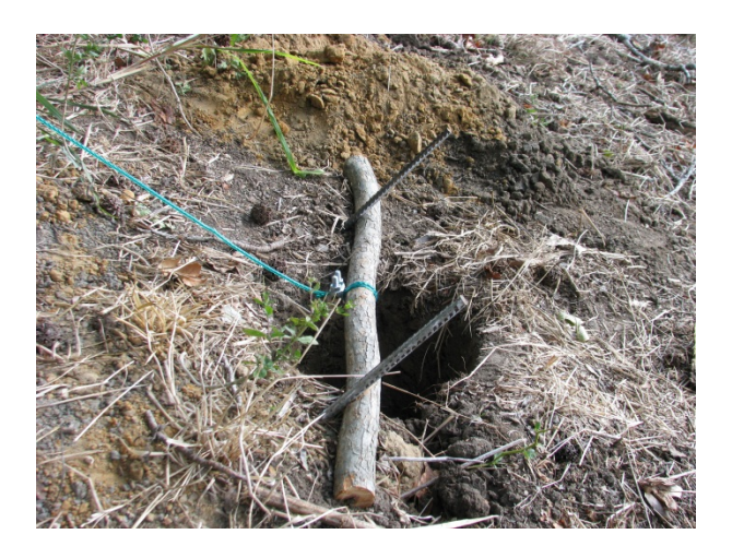
A post hole is filled with bait and rooter stick placed over the top. Rooting behavior to access bait moves the stick and triggers the gate to close.

6. Bucket Trigger-The bucket trigger works on the same principle as the hangman's platform used in the Old West-most assuredly on cowboys guilty of trapping, transporting and re-releasing wild pigs to another area! Its selectivity comes from the fact that the bucket contains both "bait and weight" (e.g., a couple of bricks or scrap iron added as ballast). The bucket should have large enough holes drilled in the sides near the bottom so bait can dribble out. The smaller pigs typically cannot knock the bucket off its perch of a cinder block or similar structure. The trigger can be made even more "adult pig specific" by increasing its height out of the easy reach of smaller pigs. It is important to have the bucket present (with some bait inside) during the pre-baiting phase to acclimate the pigs to its presence. Like other trigger designs, sufficient bait is placed inside the trap and around the trigger when camera data confirms the pig's acceptance of the trap during training. If a soured bait such as corn or milo is used, a lid can be placed on the bucket to help maintain moisture content and to dissuade non-target species.