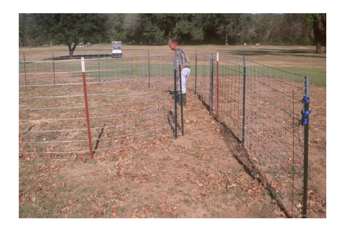
Pre-baiting a wired open Figure 6 or 9 trap.