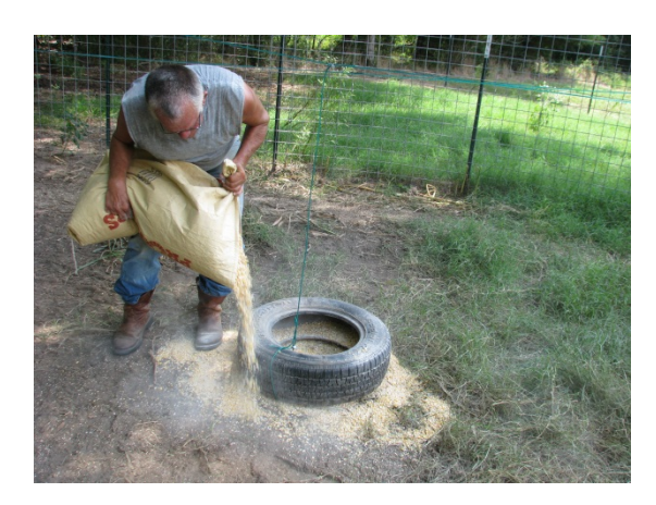
Baiting a tire trigger for pig capture.

gate installation—another Denkhaus suggestion!). When the tire is flipped or pushed, the wire leading from the tire that is attached to the main tripwire causes the first door to trip and the weight of that door falling causes the opposite gate door to trip and fall-almost simultaneously with the first door. It is a true marvel of and tribute to redneck technology!