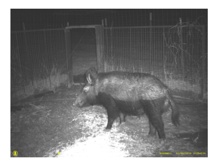
Note the "short trigger" rig in use. Since the camera confirmed only one boar entering the trap, there was no need to bait him all the way to the back of the trap where the tripwire is normally set.

4) Tripwire Trigger -The tripwire trigger simply is a length or wire, cable or other line that the pigs encounter while foraging for the bait and cause the gate to trip and close. I often use plastic-coated clothesline as the main tripwire but make a "leader" (think fishing) out of <u>braided</u> saltwater fishing line of at least 60 pounds test in the critical area where pigs will encounter the tripwire. The braid does not stretch like monofilament line and its small diameter and dark color make it difficult for pigs to detect. Educated pigs can often avoid tripwires if they are made exclusively out of heavier material such as the aforementioned plastic-coated clothesline. Do I sound like I'm paranoid? You bet I am—the boar in the photo below crossed the heavy tripwire 8 times in a 20 minute span before he finally tripped it-he simply knew it was there! The tripwire should be run above hog height from the gate along a series of tposts to about 3/4 of the way to the back of the trap where it is then angled down and run 12" high and parallel to the ground over about a 5' to 10' distance where it is then attached to the back of the trap. If baiting is done properly, the sounder of pigs should "feed their way" to the back of the trap to ensure more of the pigs are inside when the bait placed along the tripwire is consumed and the trap tripped. Smaller pigs can be prevented from tripping the gate to some degree by raising the tripwire higher above