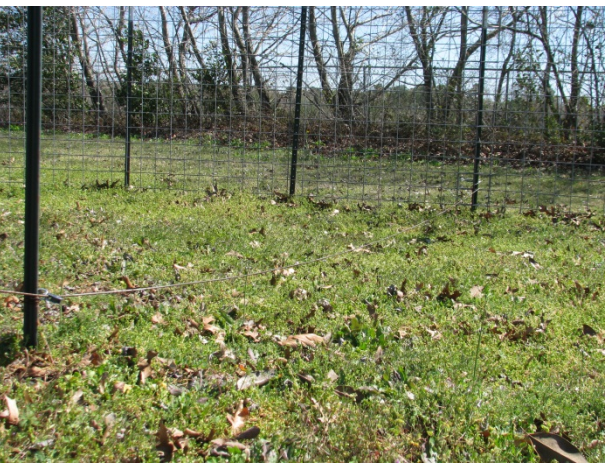
The tripwire is run parallel to the ground for 5' to 10' and attached to the back of the trap.