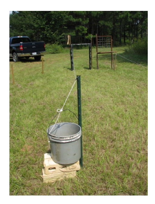
The weight of the bucket triggers the gate to close when the pigs push it off of its stand.