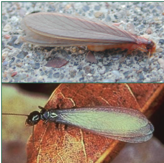
Figure 2. Desert Termite alate (top) and Subterranean Termite alate (bottom).

nean termite is relatively easy. Desert termite alates are larger ( \frac{1}{2} to \frac{5}{8} inch long) than subterranean termites (less than \frac{1}{2} inch long). The desert termite body and wings are light brown, while subterranean termite wings are transparent and the body dark brown to black (Fig. 2). Behavioral characteristics also can help with identification. A key difference is the time of day and season when they swarm. Desert termites frequently swarm just before sunset after a summer rainstorm. Subterranean termites often swarm during the day after rainfall from January through April.