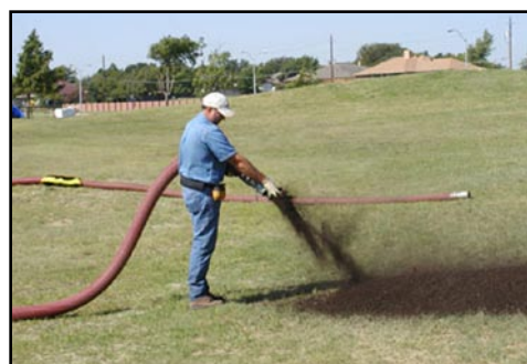
Figure 3. Grass seed and compost being applied as a filter berm to control runoff and sedimentation in a city park waterway.