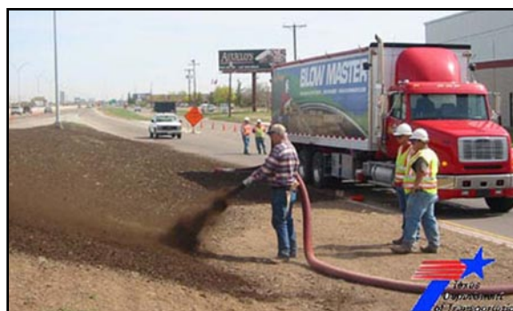
Figure 2. Grass seed and compost being applied as a compost blanket for erosion control and revegetation of a road right-of-way.

New federal storm-water-permit requirements for general construction activities and for municipalities have placed much greater responsibility on construction contractors and on local governments to put in place effective erosion and sediment controls. At the same time, recent research demonstrates the effectiveness of several practices that use compost to stabilize soil, reduce suspended solids and sediment in runoff, reduce chemical loads, and delay runoff onset and volume. Guidelines and specifications for use of compost in erosion and sediment control applications can be found in the Texas Commission on Environmental Quality (TCEQ) reference document BMP Finder at http://www.tnrcc.state.tx.us/water/quality/nps/nps_stakeholders.html#bmp%20finderD .