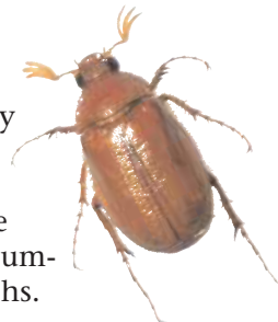
Figure 2. Adult white grubs, often called May or June beetles, are commonly attracted to lights at night.

The most important turfgrass-infesting white grubs in Texas are the June beetle, Phyllophaga crinita (Figure 2), and the southern masked chafer, Cyclocephala lurida . Warm season grasses like bermudagrass, zoysiagrass, St. Augustinegrass and buffalograss are attacked readily by both types of white grubs, with most lawn damage occurring during summer and fall months.