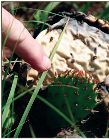
Figure 16. Silver dollar-size pad.

Another integrated method is using mechanical control to top-kill pricklypear and then applying herbicide immediately or very soon afterward. When the use of offset roller choppers or large drum aerators was followed immediately by an application of picloram, at least 90 percent of pricklypear was killed. This integrated approach should increase pricklypear control 2 to 3 fold over mechanical methods alone.