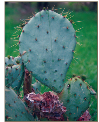
Figure 8. Mature pads.

Mature pricklypear pads have thick, fleshy coverings coated with a heavy wax that makes the plant appear shiny. This thick, tough skin, along with the succulent nature of cacti, helps plants survive during drought. The plants use most of their internal tissues for water storage and their outer parts to reduce water loss and damage by grazing animals and predatory insects. They can remain relatively vigorous in hot, dry conditions that cause most other plants to lose vigor or even die. The pad surfaces are covered with small bud zones called areoles. From these areoles emerge either short, dense spines or longer, heavier spines (1 to 4 inches), or both. Pricklypear species cannot be identified by spine characteristics alone because there is so much variation within species. Flowers and new stems also emerge from areoles.