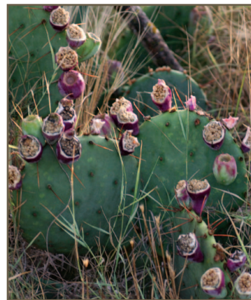
Figure 11. Fruits eaten by sheep.

On the positive side, pricklypear is moderately high in energy and appears to be high in vitamin A. It is also high in dietary calcium and magnesium. But the high intake of these ions results in an increased rate of passage through the digestive tract, which leads to scouring because of water retention in the gut. This increased rate of passage also reduces the absorption of the nutrients from pricklypear. Therefore, cattle eating pricklypear should also have hay or some other forage to increase dry matter intake and reduce the rate of passage.