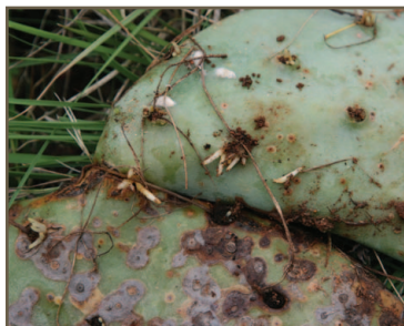
Figure 7. Adventitious roots.

hard seed coats allow them to survive heat and lack of water and pass undamaged through the digestive systems of grazing animals and birds. Seed germination is the primary method of reproduction in undisturbed habitats. Seeds are dispersed mainly through animal droppings, including birds. Vegetative reproduction occurs when pads are detached from the parent plant by animals, wind, flood or mechanical disturbance and take root where they lodge. Pricklypear stems or pads quickly produce adventitious roots and form new plants when they contact moist soil.