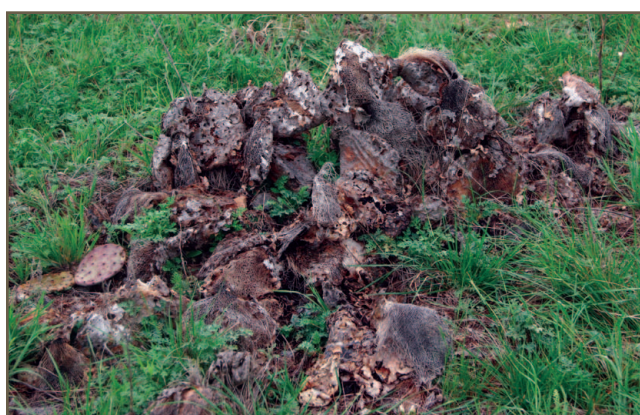
Figure 14. Pricklypear controlled with herbicides.

Individual plant treatments are considered most effective because spray can be targeted directly onto pricklypear.