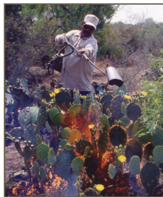
Figure 10. Pricklypear being burned by ranch hand.

Although pricklypear are tough and thorny, they are food for both man and animal. Their pads and stems are fed to animals in Texas and Mexico, especially during drought conditions. The spines are burned away so that livestock, particularly cattle, will consume the plant.