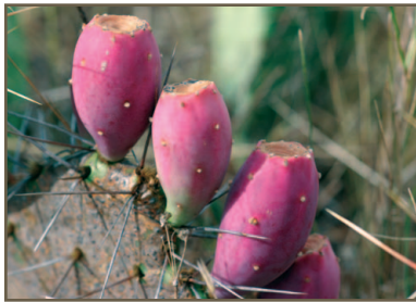
Figure 6. Mature fruits.

hard seed coats allow them to survive heat and lack of water and pass undamaged through the digestive systems of grazing animals and birds. Seed germination is the primary method of reproduction in undisturbed habitats. Seeds are dispersed mainly through animal droppings, including birds. Vegetative reproduction occurs when pads are detached from the parent plant by animals, wind, flood or mechanical disturbance and take root where they lodge. Pricklypear stems or pads quickly produce adventitious roots and form new plants when they contact moist soil.