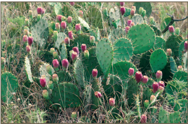
Figure 3. Engelmann pricklypear.

spines. Engelmann pricklypear grows to 6 feet or more and has the largest pad, at 8 to 16 inches long, with white spines. It is scattered throughout the Edwards Plateau and Trans-Pecos regions. Plains pricklypear is typical of the Rolling and High Plains regions and is a short, spreading variety.