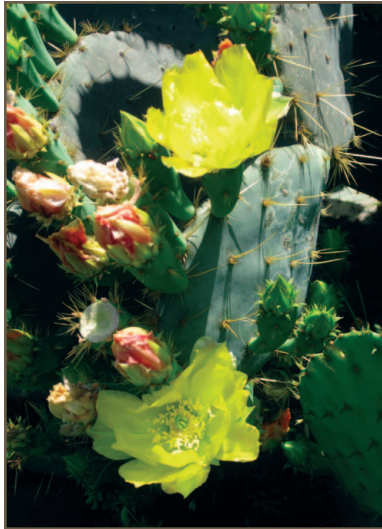
Figure 5. Flowers.

relatively large seeds that are flat and round. The large, rounded, flat segments of pricklypear are commonly called pads. These pads are often mistaken for the plant's leaves but are actually modified stems. True pricklypear leaves are small and appear only briefly at the cluster of spines when new pads emerge in spring.