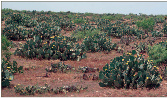
Figure 9. Mature population.

thesis occurs during daylight hours because it requires sunlight. This type of photosynthesis is very costly for a plant in extremely hot or dry conditions as a significant amount of water can be lost as vapor during gas exchange.