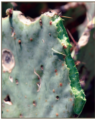
Figure 12. Deer browsed pad.

dry summer months when deer consume pricklypear presumably for the water source. Wildlife also relish young leaves in the spring and fruits in the fall.