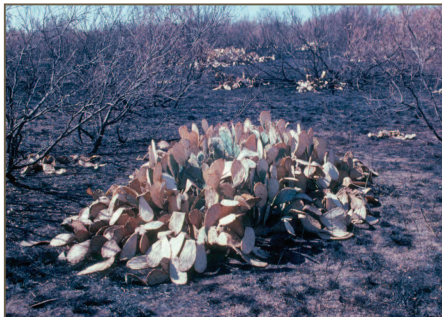
Figure 13. Pricklypear after a summer fire.

For effective control of pricklypear, fires must be very hot to rupture pricklypear cells and physically damage the plant. Summer fires are more effective than winter fires.