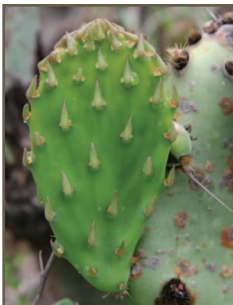
Figure 4. New pad growth with leaves.

Typical characteristics of Opuntia species include jointed stems; cylindrical or conical leaves on young stems; small spines called glochids; spreading, showy flowers with sensitive stamens; and fleshy, edible fruits with thick rinds and