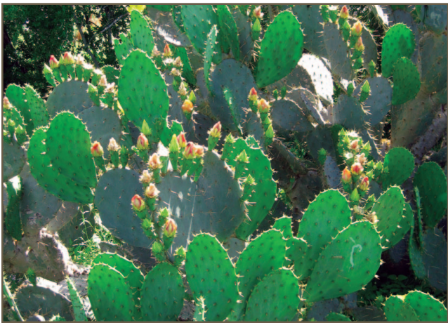
Figure 2. Lindheimer pricklypear.

Lindheimer pricklypear is considered the most abundant and widespread in Texas. The typical Lindheimer pricklypear is 2 to 5 feet high. Its oval pads are 8 to 12 inches long and covered with erect, yellow spines. More common in the Edwards Plateau region is Edwards pricklypear. It is usually less than 1 foot high and has 4- to 6-inch rounded pads covered with slightly curved, gray