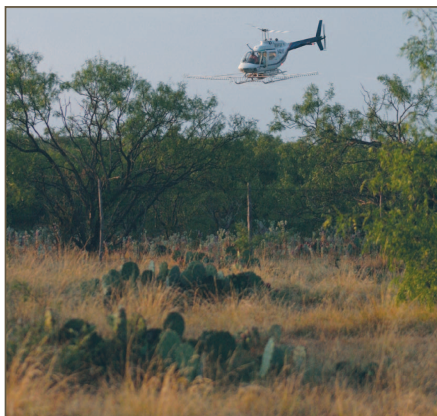
Figure 15. Aerial application of herbicide.

Applications of Tordon 22K™ or Surmount™ in a 1% solution in water are currently suggested for this application method. Adding MSO and a blue marker dye is recommended. When treating individual plants, be careful to treat both sides of the pads and completely cover the plant. If done properly, this method will kill 80 to 90 percent of pricklypear. Other herbicide options and specific “how to” recommendations for individual plant treatments can be found in Texas AgriLife Extension publication L-5171, How to Take Care of Pricklypear and Other Cacti .