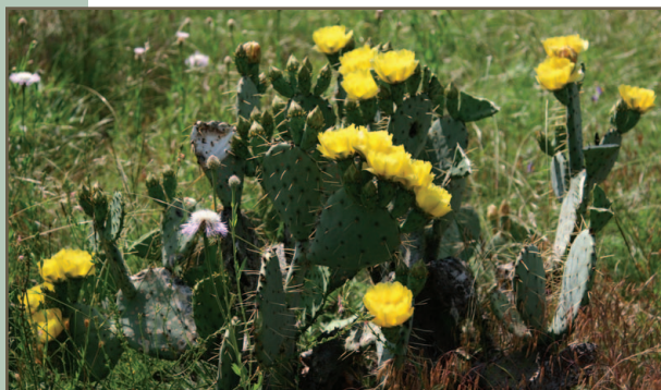
Figure 1. Engelmann pricklypear.

Pricklypear is the common name given to a large group of succulent cacti in the Opuntia genus. This genus is the most widespread and common of all cacti (Cactaceae family) in the world. There are more than 40 species and varieties in Texas, including pricklypear, tasajillo and cholla cactus. Most