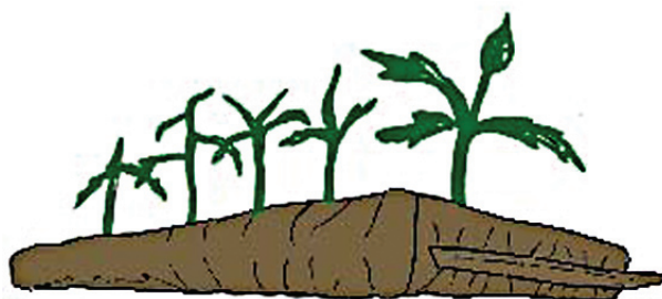
A "tube" or bag garden is an easy method to grow vegetables.

The seed should be started in a warm area that receives sufficient sunlight about 4 to 8 weeks before you plan to transplant them into the final container. Most vegetables should be transplanted into containers when they develop their first two to three true leaves. Transplant the seedlings carefully to avoid injuring the young root system. (See Table 2 for information about different kinds of vegetables.)