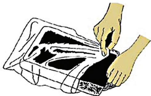
Covering the seed flat with a clear plastic bag will hasten germination.