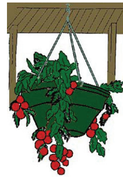
Small fruited tomato varieties make excellent hanging baskets.

Variety selection is extremely important. Most varieties that will do well when planted in a yard garden will also do well in containers. Some varieties of selected vegetables which are ideally suited for these mini-gardens are indicated in Table 1.