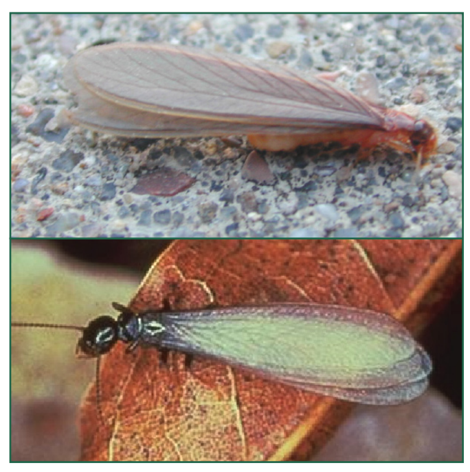
Figure 2. Desert Termite alate (top) and Subterranean Termite alate (bottom).

nean termite is relatively easy. Desert termite alates are larger (½ to 5% inch long) than subterranean termites (less than ½ inch long). The desert termite body and wings are light brown, while subterranean termite wings are transparent and the body dark brown to black (Fig. 2). Behavioral characteristics also can help with identification. A key difference is the time of day and season when they swarm. Desert termites frequently swarm just before sunset after a summer rainstorm. Subterranean termites often swarm during the day after rainfall from January through April.