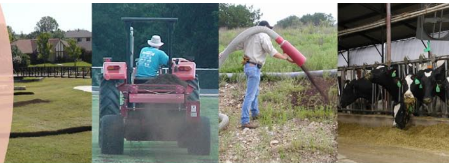
Dairy Compost Utilization

*Associate Professor and Extension Agricultural Engineering Specialist – Waste Management