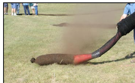
Figure 4. Compost and wood-chip mixture applied in a mesh casing as a filter sock to control runoff and sedimentation.

The Texas Department of Transportation (TxDOT) has used composted dairy manure, feedlot manure, chicken litter, cotton gin burs, yard trimmings, and municipal biosolids as compost blankets for hydroseeding road rights-of-way to control soil erosion from steep slopes (Fig. 2) and as filter berms to control erosion and sedimentation from low- volume runoff (Fig. 3). Recent projects have used filter socks rather than berms, because socks have a greater ability to withstand concentrated flows and to retain sediment (Fig. 4). Another applications at a West Texas municipal landfill uses compost produced from a mixture of poultry manure, sawdust and other wood residuals to control erosion, as a soil amendment and to create a vegetated cover over closed landfill cells.