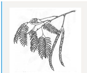
Honey Mesquite leaves and beans. Courtesy of: TREES, SHRUBS AND WOODY VINES OF THE SOUTHWEST by Robert A. Vines, Illustrated by Sarah Kahlden Arendale, Copyright ©1960

These Brush Busters control methods depend on the tree shape and size. For mesquite with three or fewer smooth bark stems coming out of the ground, the stem spray method may be a good option. For bushy mesquite less than 6 feet tall with many stems at ground level, the leaf spray method may be the best option. Either method can be successful.